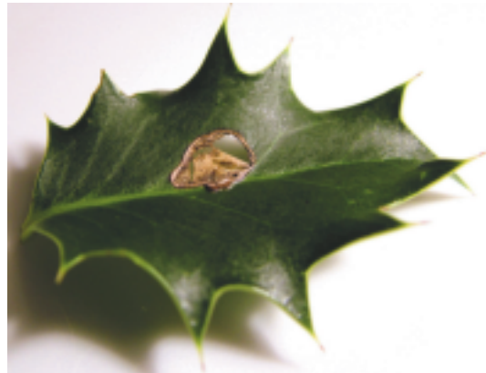
Figure 4 V-shaped tear caused by blue tit predation.

Competing with the blue tits are a number of parasites. The most important of these is the wasp Chrysocharis gemma (another secondary consumer),