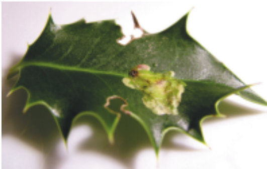
Figure 2 Large emergence hole left by escaping adult miner fly. The opening of the 'emergence plate' has left a triangular flap of leaf cuticle.