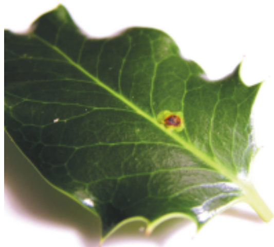
Figure 5 Small round emergence hole created by an adult parasitic wasp. Such holes may be found on either side of the leaf.

which attacks the fly larvae. The adult parasite inserts a single egg through the leaf cuticle into the body cavity of a miner-fly larva. Attacked larvae appear flaccid and pale, dirty yellow compared with the turgid, bright, shiny, whitish-lemon, healthy larvae. The parasite larva feeds within the fly larva, and eventually kills it. It then forms a shiny jet-black pupa that lies free inside the mine. Evidence that the adult parasite has emerged is a very small, neat, round hole found on either side of the mined leaf (Figure 5). Also leaving as evidence a small emergence hole, is another parasitic wasp, Sphegigaster flavicornis , which attacks the pupa (not the larva) of the miner fly. The adult parasite bores through the leaf cuticle