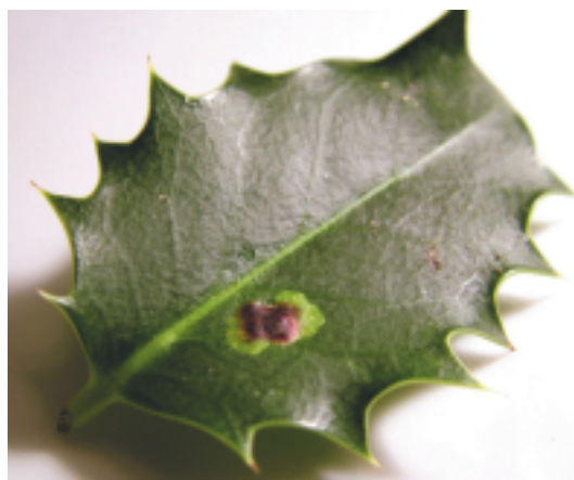
Figure 1 Characteristic patch beneath the surface of the leaf caused by the larva of a holly leaf miner.

The larvae of the Agromyzid leaf-miner fly ( P. ilicis ) burrow in the mesophyll of holly leaves ( I. aquifolium ) and produce characteristic white patches known as mines beneath the surface (Figure