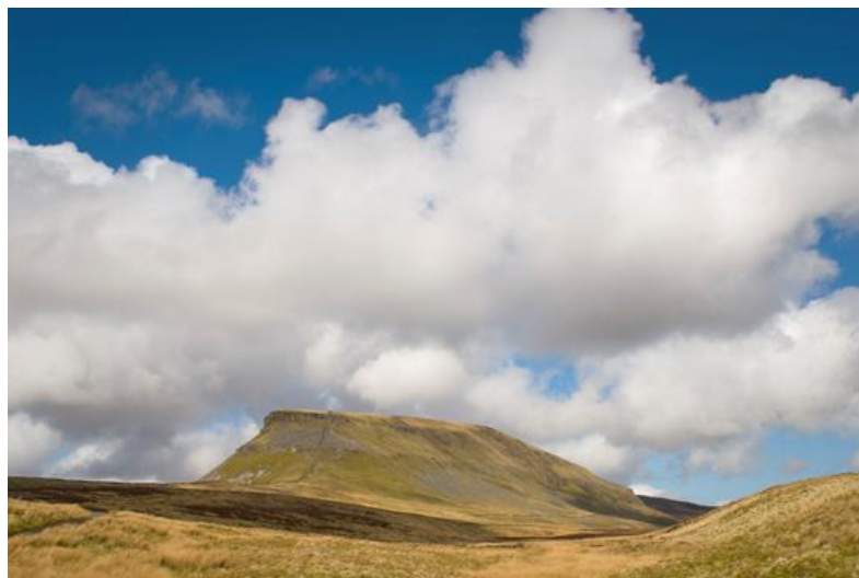
Pen-y-ghent

Important It is in your own interests to inform the Centre of any medical problems, disabilities, allergies or dietary requirements you may have. All information will be treated in confidence.