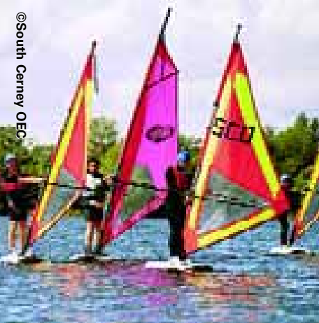
@South Cerney OEC