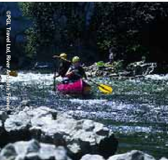
River Ardèche, France

Education and Skills Select Committee 2005