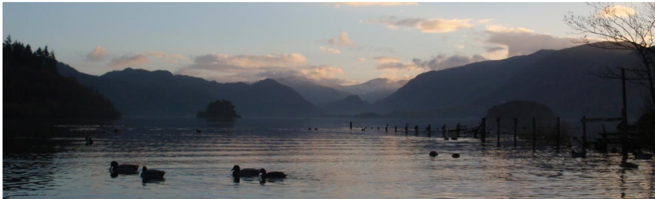
View over Derwentwater