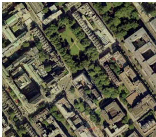
Figure 9. Aerial photograph of Gordon and Woburn Squares.

Gordon and Woburn Squares are tightly locked between small side streets leading from one of the busiest highways in London - the Euston Road. Lying to the north of the Euston Road are three of the capital's main commuter gateways: Euston, King's Cross and St. Pancras railway stations. The pollution monitoring station located on the Euston Road has recorded some of the highest levels of air pollutants to be found in London. The source of most of these pollutants is from vehicle emissions.