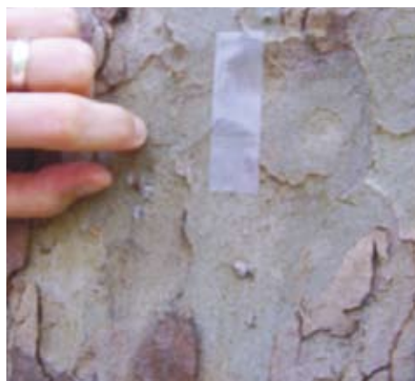
Figure 10. Use of sticky tape for sampling.

Stick the samples onto the individual results sheet (Sheet 1) for the correct site. If there is time, a third sample can be taken and placed onto a labelled microscope slide, so that the samples can be studied in much greater detail in the laboratory.