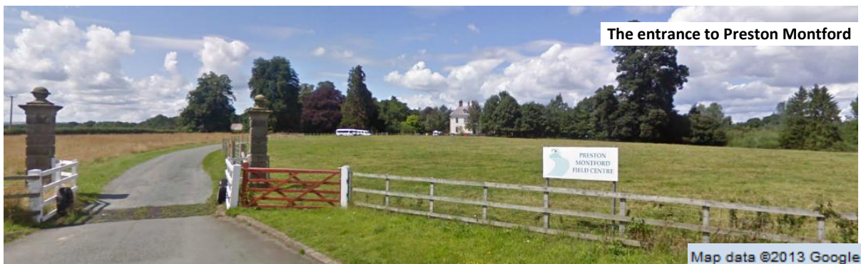
The entrance to Preston Montford

If you are travelling with a Sat Nav, the postcode for the Preston Montford centre is SY4 1DX.