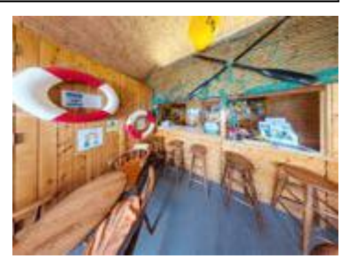
Shop and Bar