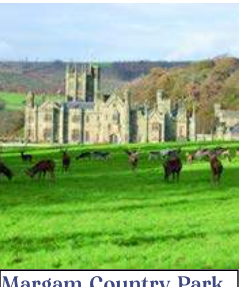
Margam Country Park